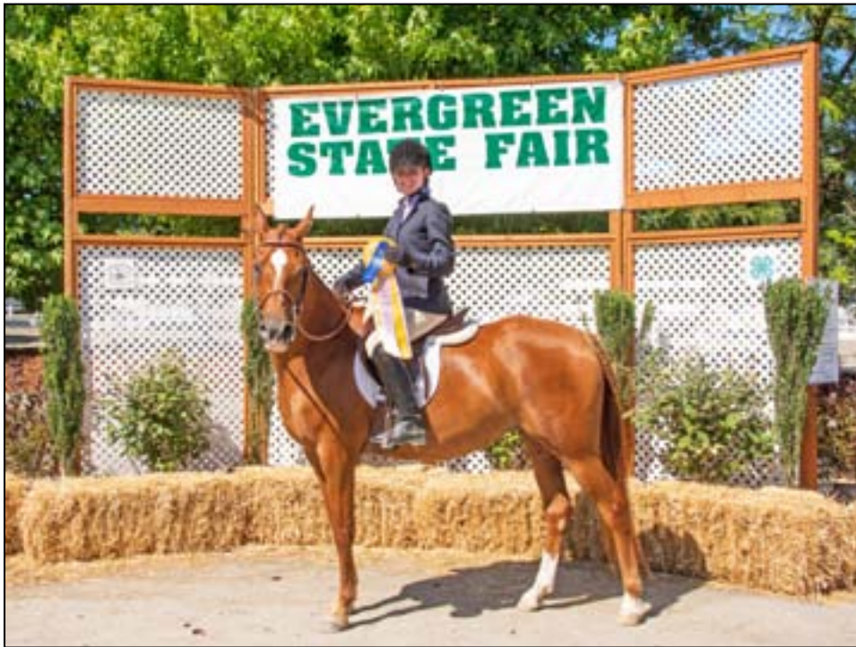
Many young people participate in the 4-H competitions at the Evergreen State Fair.