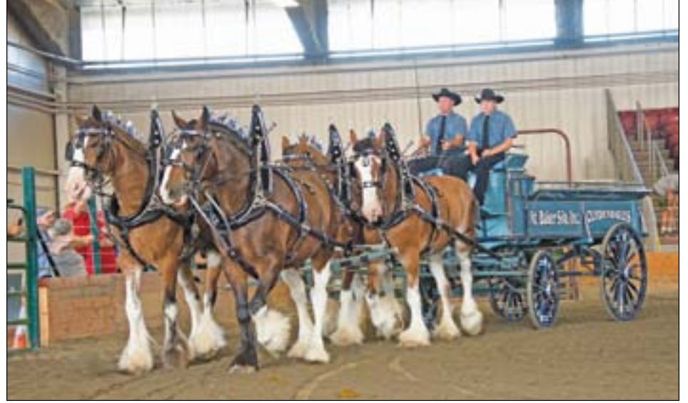
Be sure to check out the big Gentle Giants during the Fair at the Washington Draft Horse and Mule Extravaganza and at the Western Regional Clydesdale Show.

For more information on the Pro-West Rodeo, please see page 1B.