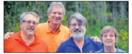
Under the Radar

Under The Radar, a mixed a cappella quartet, will share fun and the joy of music including pop and doo-wap tunes from the '50s-'70s, as well as Great American Songbook standards.