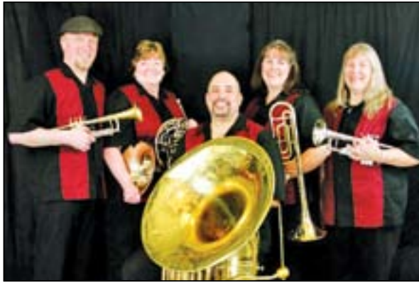
Tarnished Brass Quintet

They will perform marches, swing, Dixieland and some pop!